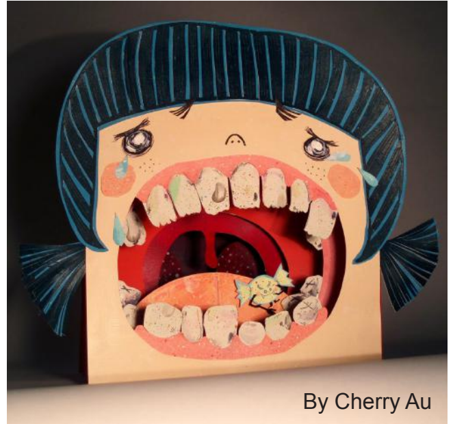
By Cherry Au